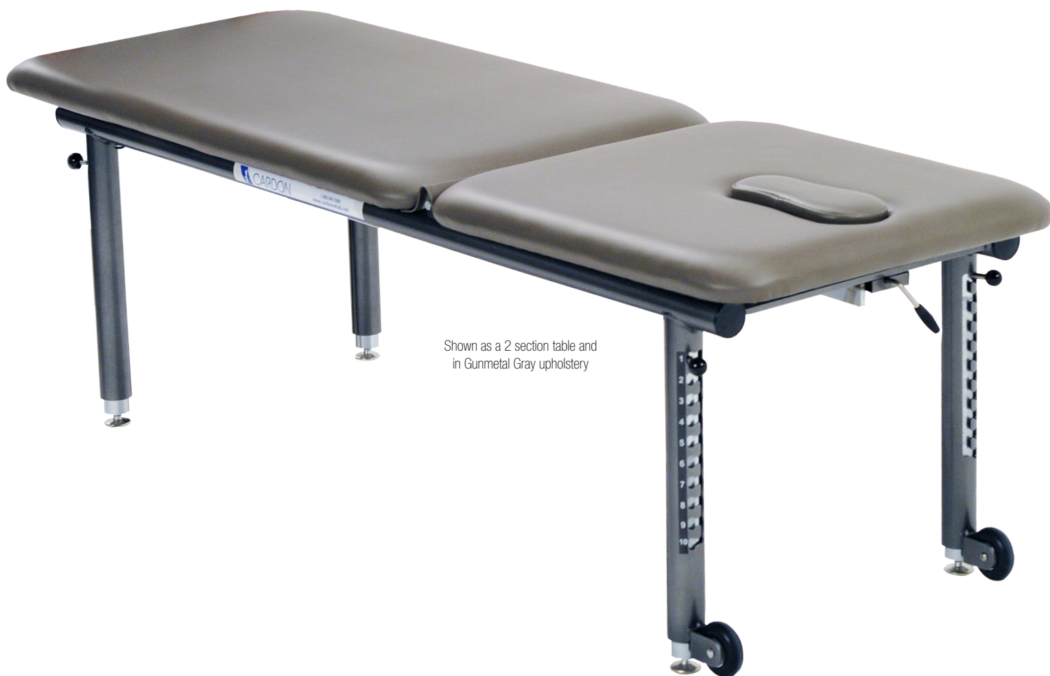
Shown as a 2 section table and in Gunmetal Gray upholstery