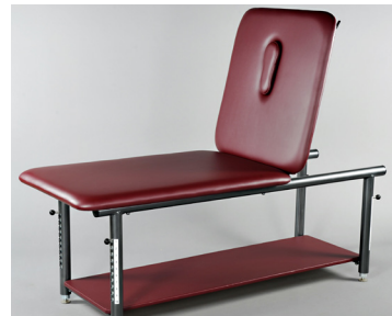
Shown as 2 section with optional shelf and gas spring for backrest