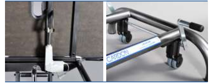
Power assisted head section