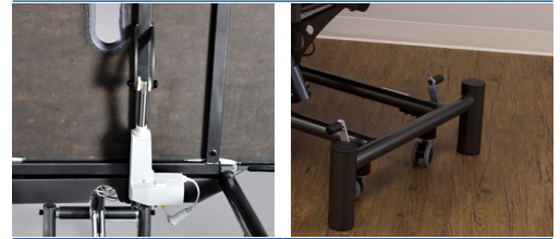
Power assisted head section