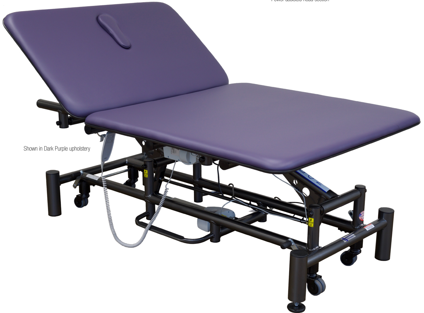
Shown in Dark Purple upholstery