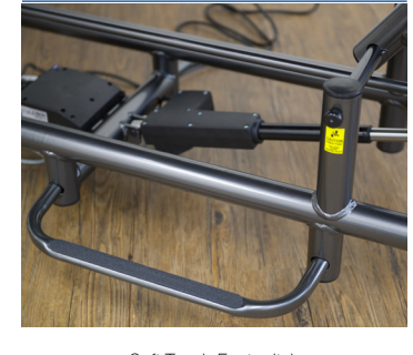
Soft Touch Footswitch