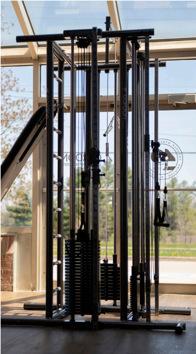
Shown with Cardon Standard Pulley, Speed Pulley, Lateral Pulley and Mounting Ladder and Slant Board