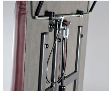
Shown with optional gas spring for backrest