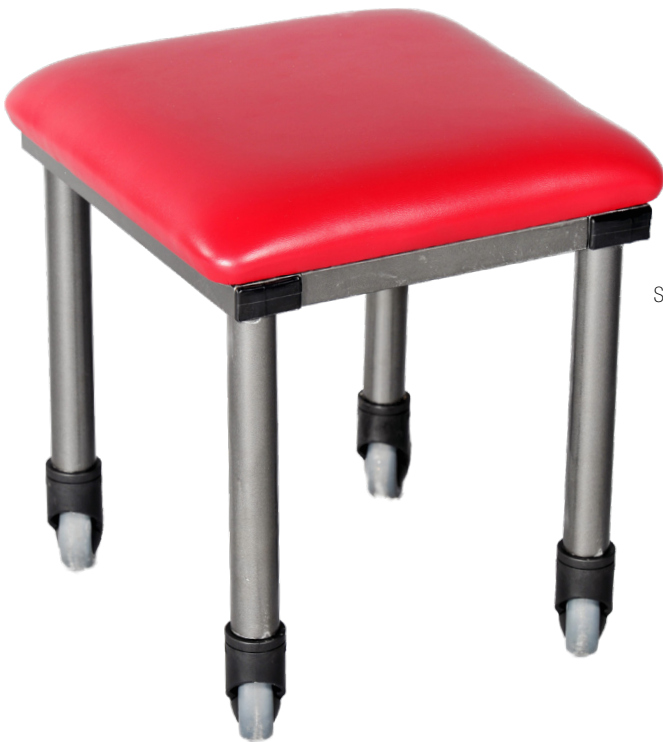
Shown in Dark Cherry upholstery