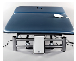
Power assisted head section