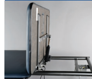
Power assisted head section