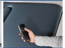
Hand held control for power assisted head section