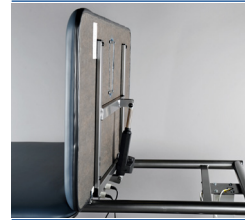
Power assisted head section