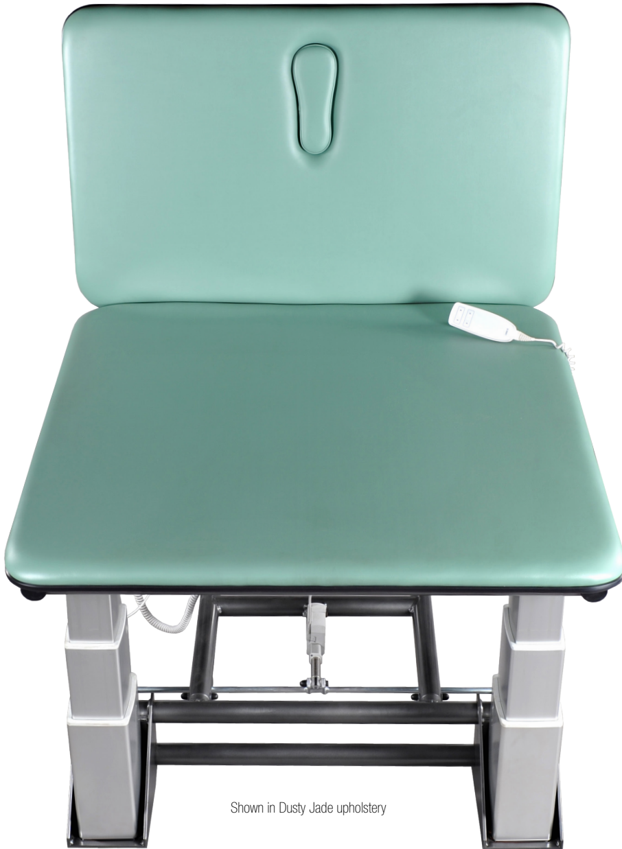
Shown in Dusty Jade upholstery