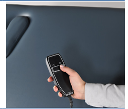
Hand held control for power assisted head section