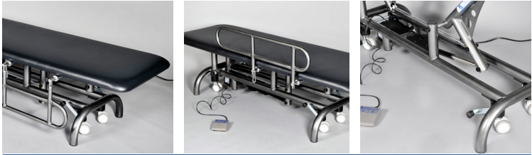
Optional assist rail