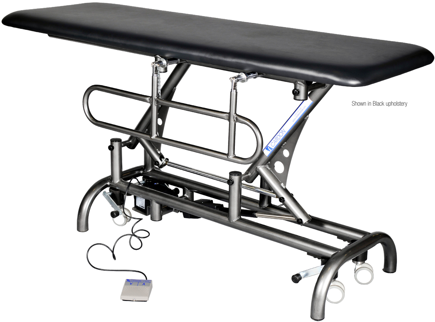
Shown in Black upholstery