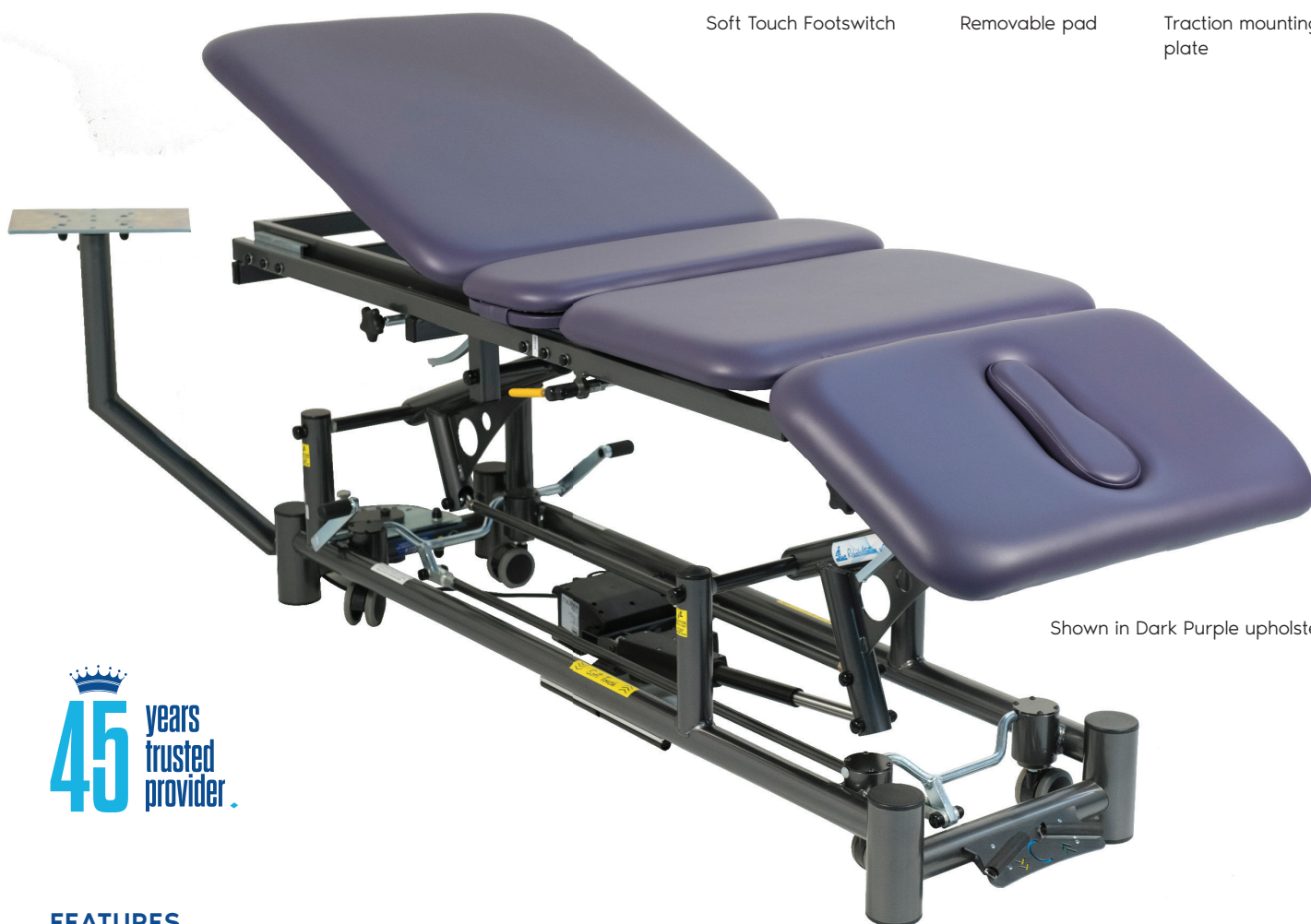
Shown in Dark Purple upholstery