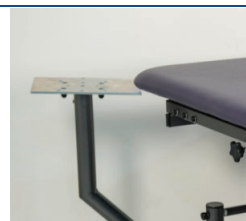
Traction mounting plate