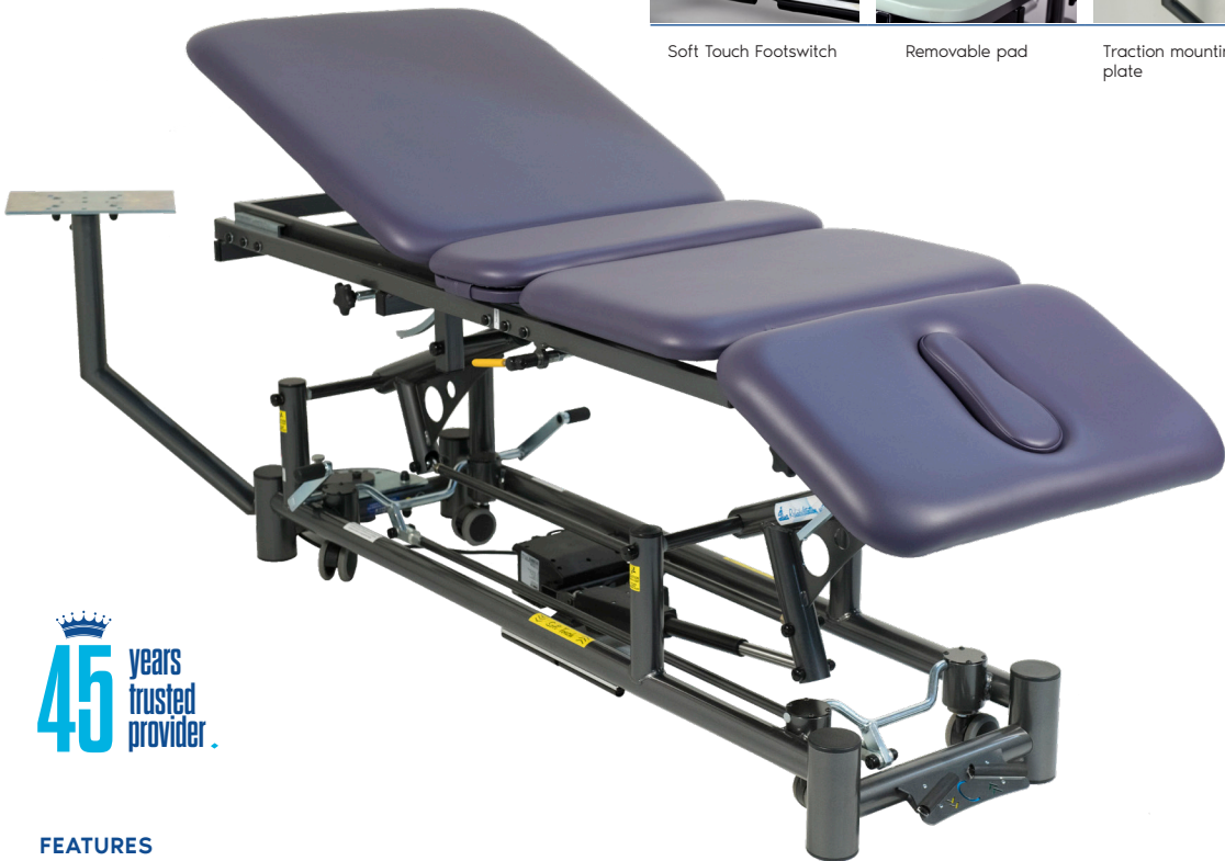
Traction mounting plate