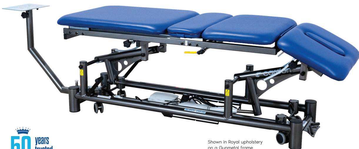
Shown in Royal upholstery on a Gunmetal frame