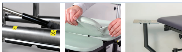
Soft Touch Footswitch