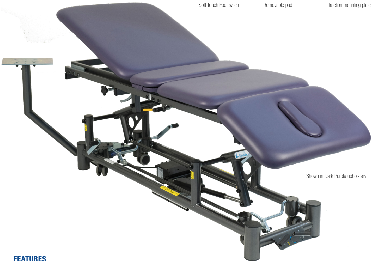
Shown in Dark Purple upholstery