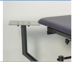
Traction mounting plate