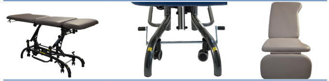
Shown with ultrasound cut-out