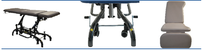
Shown with ultrasound cut-out