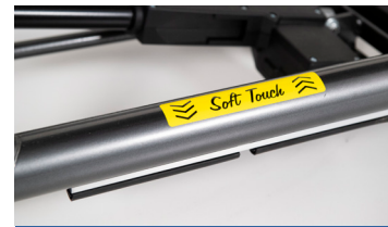
Soft touch footswitch