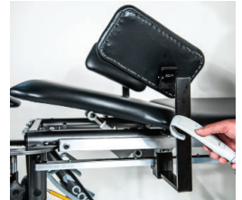
Powered pelvic tilt seat with handheld control for patient positioning and comfort