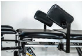
Thigh support inserts slides along length of table

Cardon's patented Soft Touch Footswitch has been strategically positioned on the base of your treatment table. Minimal amount of pressure applied by your foot will raise and lower the table with ease.