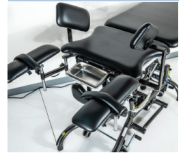
Available with tray