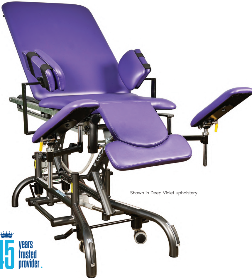
Shown in Deep Violet upholstery