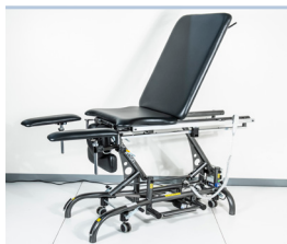
Available with tray