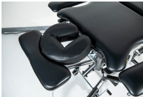
Massage head section with interchangeable pads for patients lying prone or supine