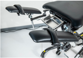
Straps provided to secure feet to footrests