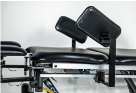
Thigh support inserts slides along length of table

Cardon's patented Soft Touch Footswitch has been strategically positioned on the base of your treatment table. Minimal amount of pressure applied by your foot will raise and lower the table with ease.