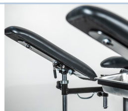
Angled footrest for maximum patient comfort