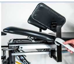
Powered pelvic tilt seat with handheld control for patient positioning and comfort