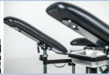
Angled footrest for maximum patient comfort