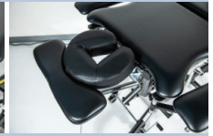
Massage head section with interchangeable pads for patients lying prone or supine