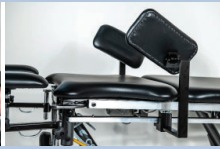
Thigh support inserts slides along sides of the table