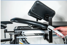
Powered pelvic tilt seat with handheld control for patient positioning and comfort