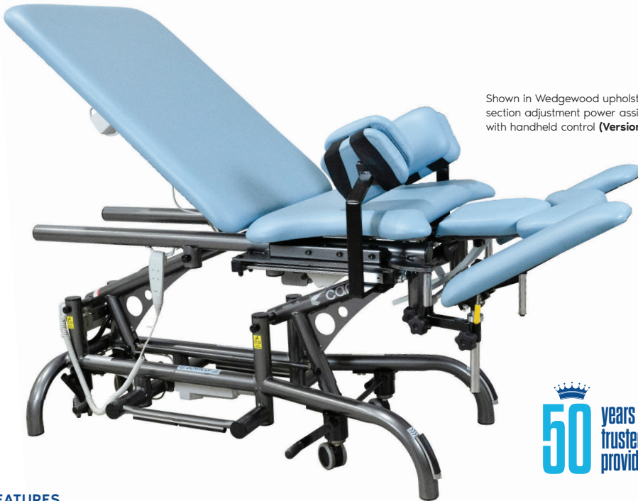
Shown in Wedgewood upholstery. Leg section adjustment power assisted with handheld control ( Version C )