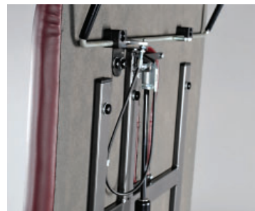
Shown with optional gas spring for backrest