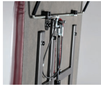
Shown with optional gas spring for backrest