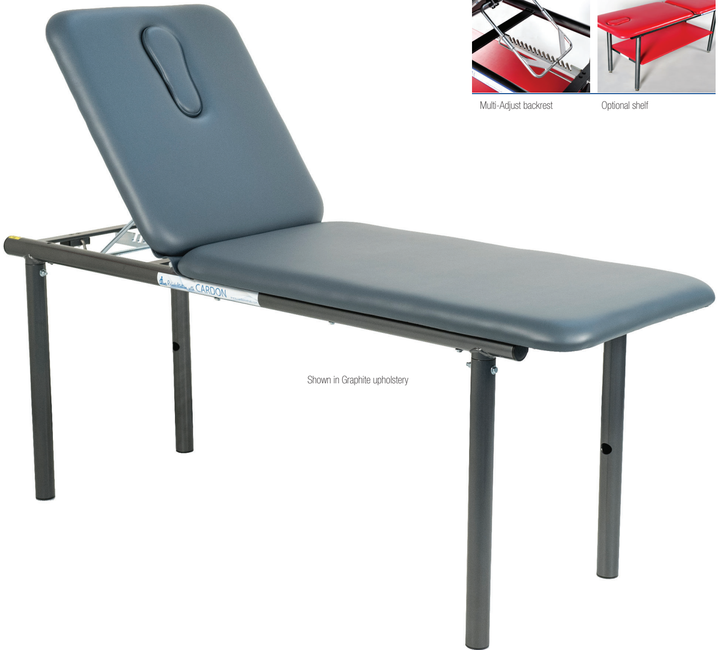
Shown in Graphite upholstery