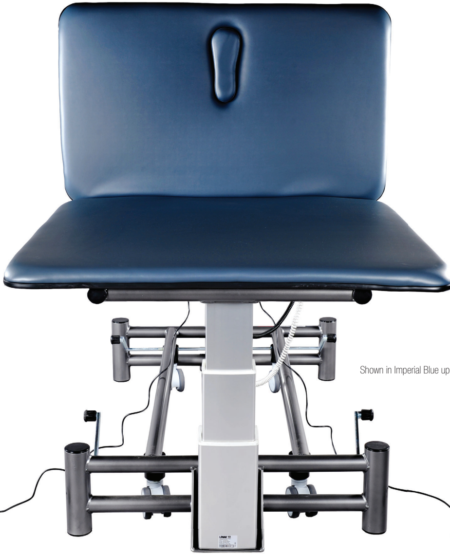
Shown in Imperial Blue upholstery