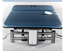
Power assisted head section