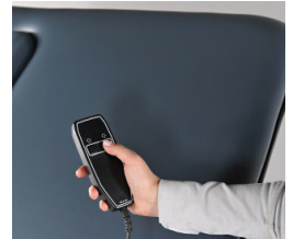
Hand held control for power assisted head section