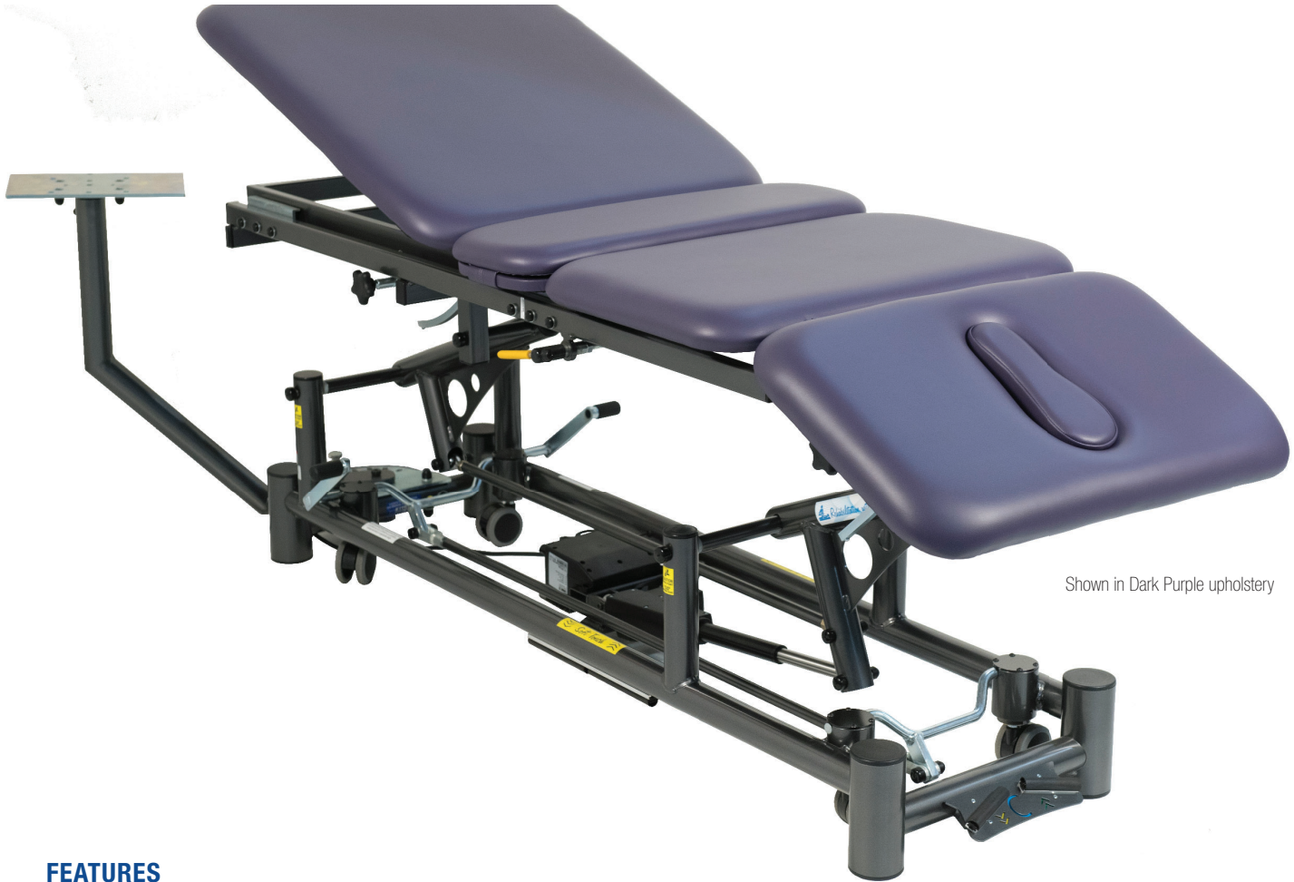
Shown in Dark Purple upholstery