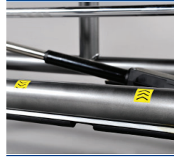
Soft Touch Footswitch