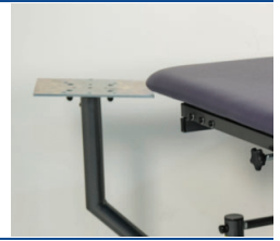
Traction mounting plate