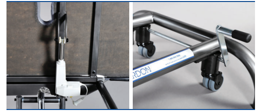
Power assisted head section