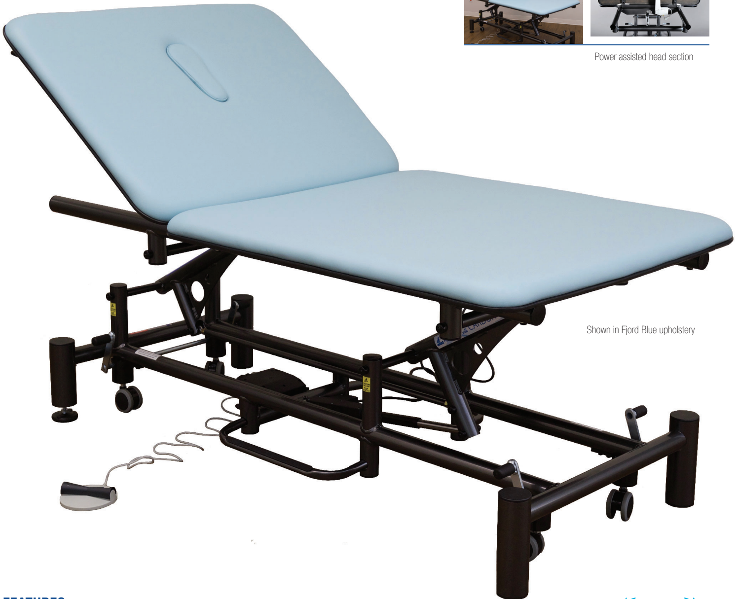
Shown in Fjord Blue upholstery