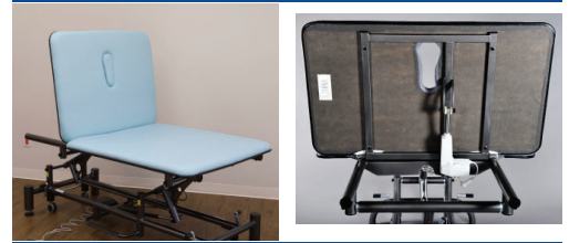
Power assisted head section