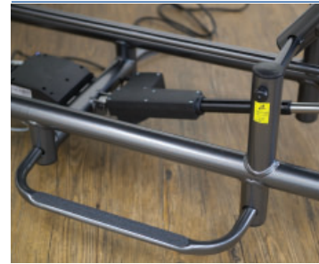
Soft Touch Footswitch