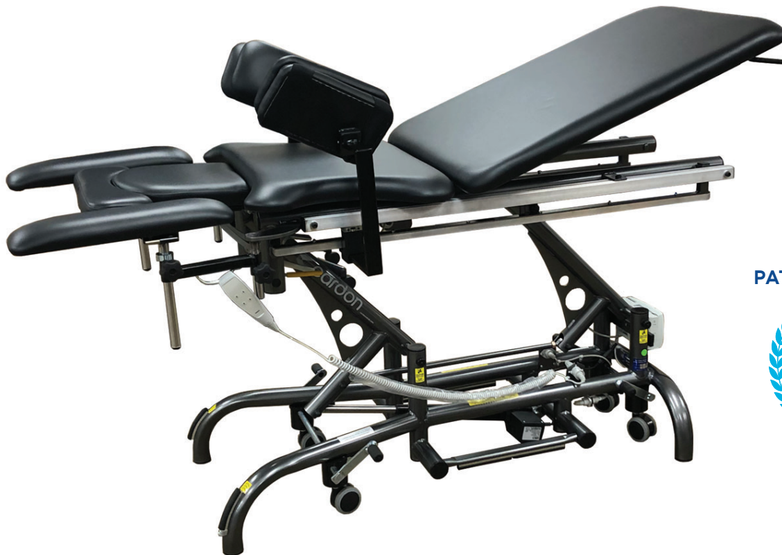
Angled footrest for maximum patient comfort