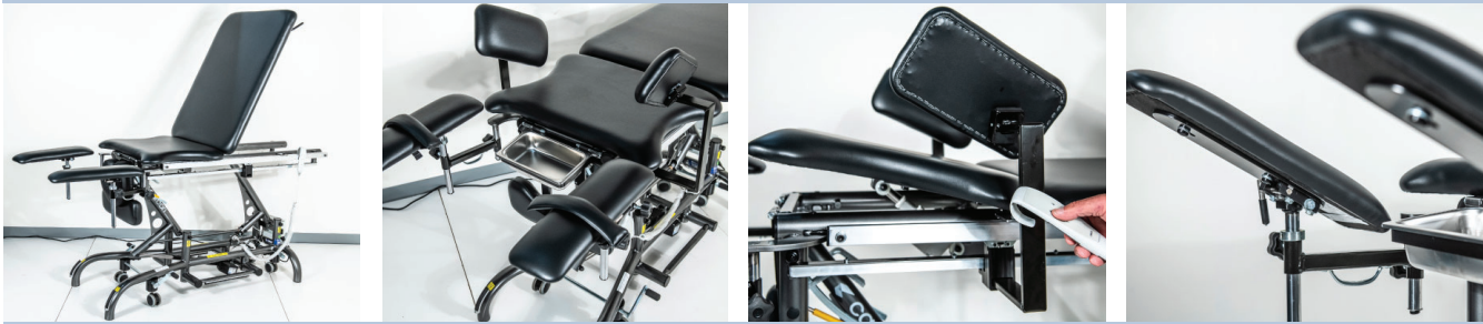
Available with tray