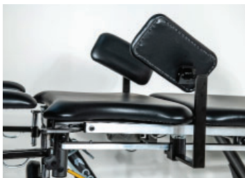
High support inserts slides along length of table

Cardon's patented Soft Touch Footswitch has been strategically positioned on the base of your treatment table. Minimal amount of pressure applied by your foot will raise and lower the table with ease.