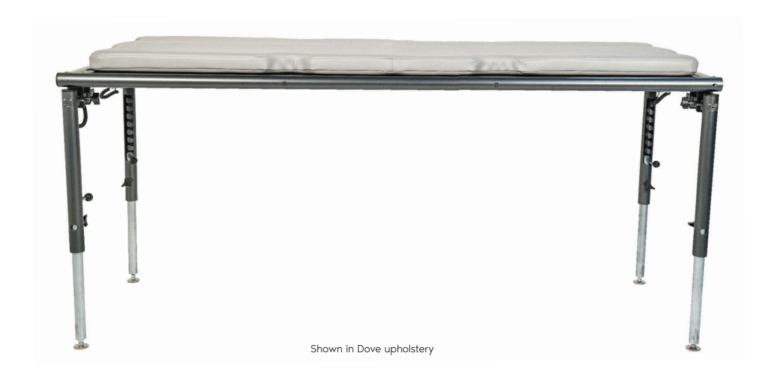
Dual surface for the modern classroom