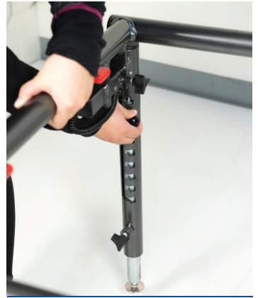
Height adjustable and collapsible treatment table