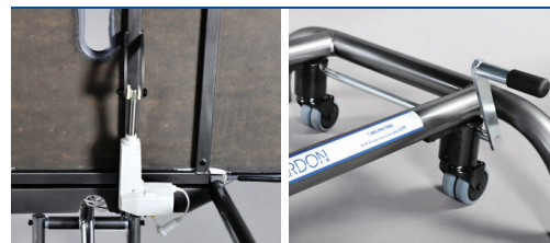
Power assisted head section