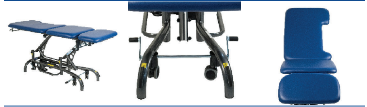
Shown with stress echo cut-out