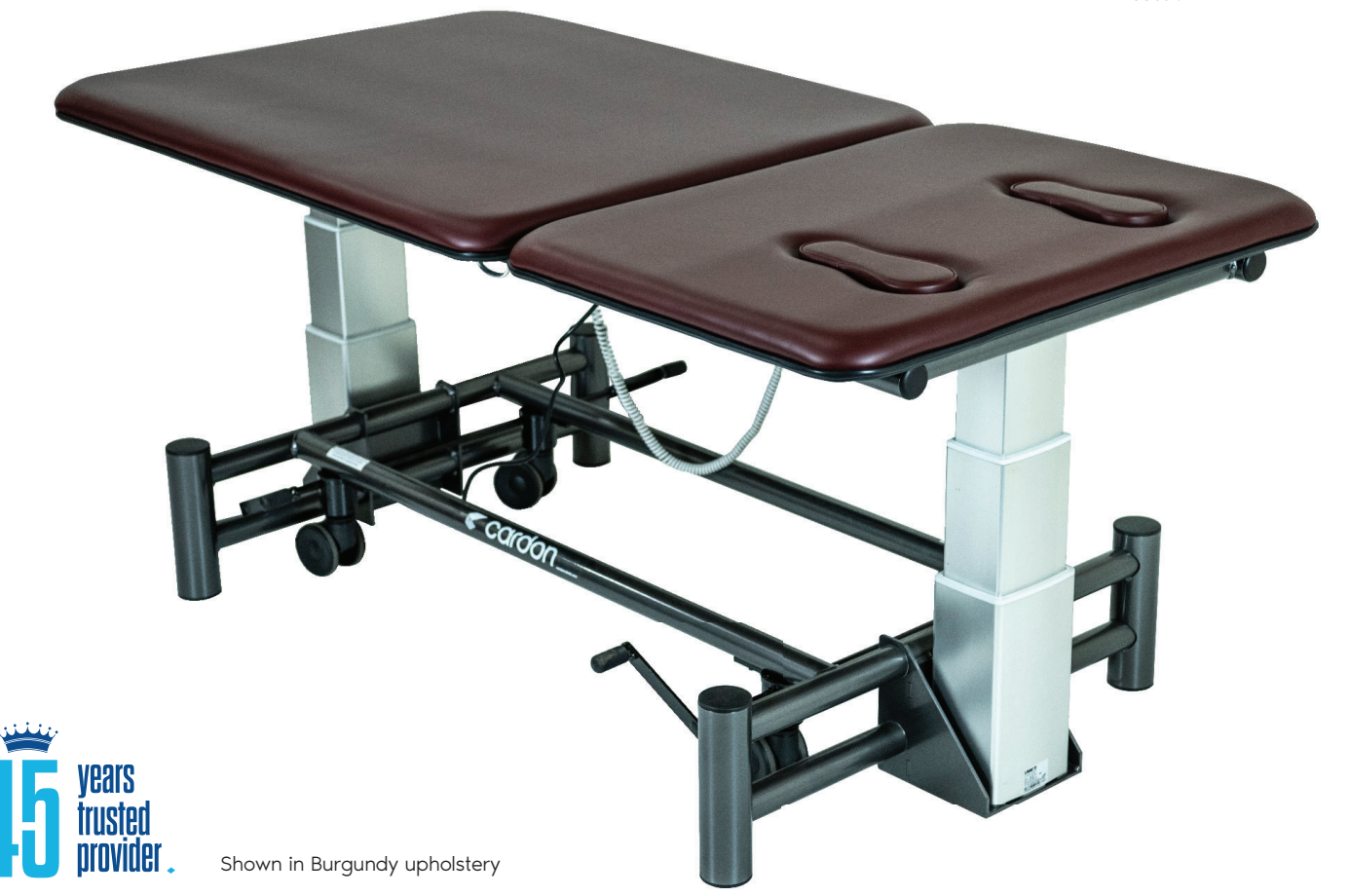
Hand held control for power assisted head section