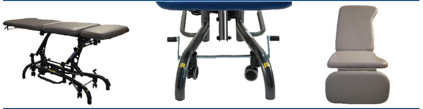
Shown with ultrasound cut-out