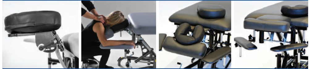
Optional Pro head section