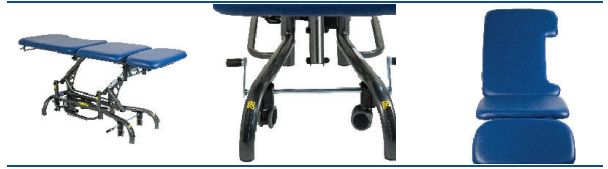
Shown with stress echo cut-out