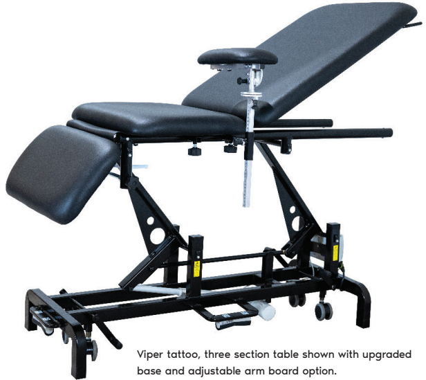
Viper tattoo, three section table shown with upgraded base and adjustable arm board option.