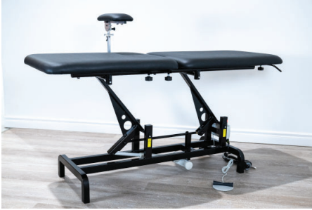
Two section model