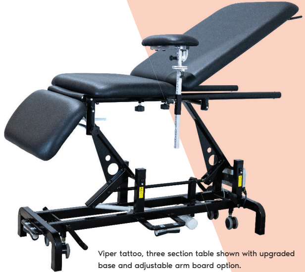
Viper tattoo, three section table shown with upgraded base and adjustable arm board option.